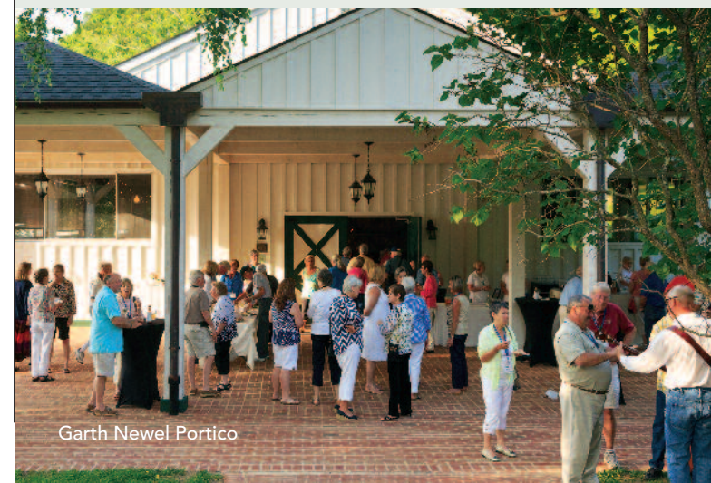
Garth Newel Portico